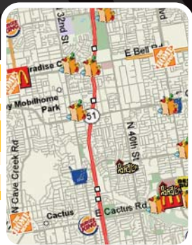
Minimize Site Selection Risk