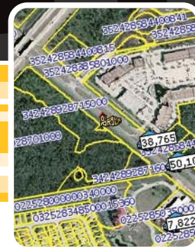
Accelerate Rollout and Portfolio Decisions

The powerful retail dimension of CoStar Property Professional reduces the time, expense and risk of retail real estate decisions.